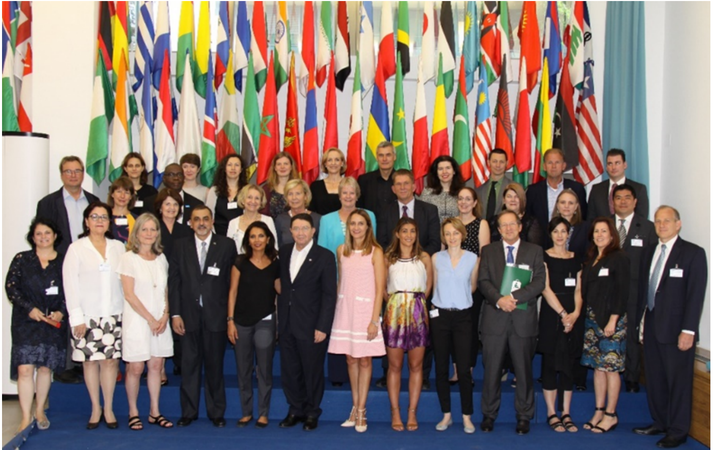
MADRID, JULY 13 TH 2017 UNWTO HEADQUARTERS